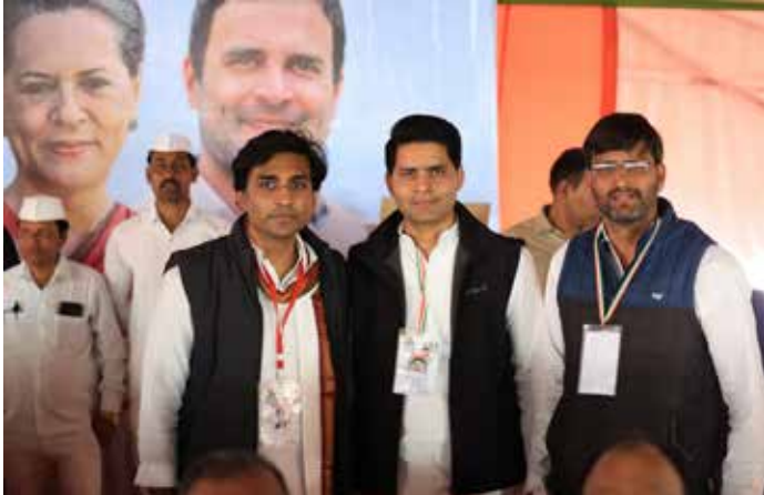
Congress leaders attend Mhow'Jai Bapu, Jai Bhim, Jai Samvidhan' rally.