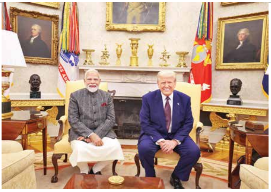
Following a meeting between two global leaders, Prime Minister Narendra Modi and President Donald Trump converse with journalists at the White House in Washington, D.C., on February 13, 2025.

The leaders agreed that energy security is fundamental to economic growth, social well-being and technical innovation in both countries. They underscored the importance of USA.-India collaboration to ensure energy affordability, reliability, and