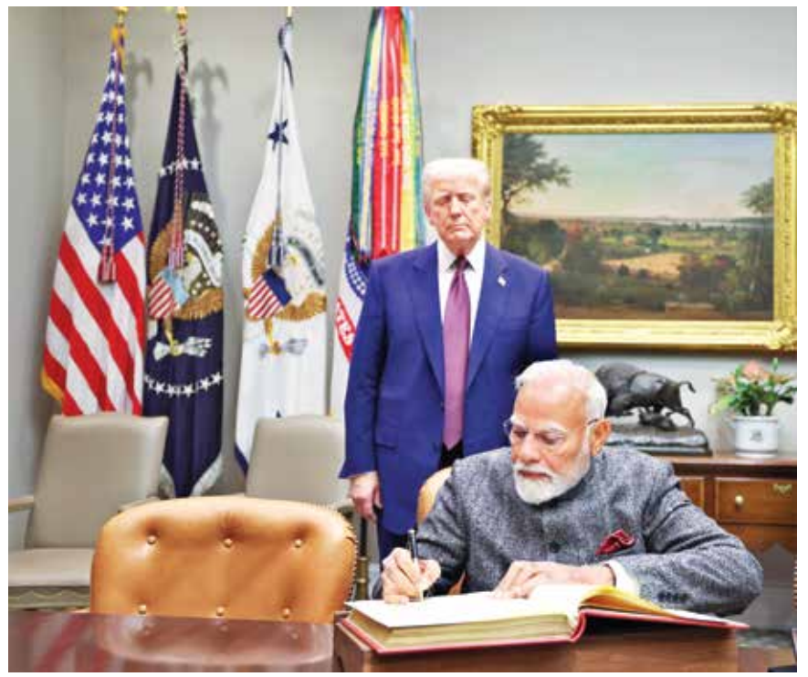
Prime Minister Narendra Modi writing his remarks in the visitor book at White House in Washington DC, USA on February 13, 2025.

availability and stable energy markets. Realizing the consequential role of the U.S. and India, as leading producers and consumers, in driving the global energy landscape, the leaders recommitted to the U.S.-India Energy Security Partnership, including in oil, gas, and civil nuclear energy.