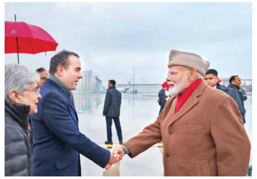
Sebastien Lecornu, Minister of the Armed Forces of France, greets Prime Minister Narendra Modi upon his arrival at Orly Airport in Paris, France, on February 10, 2025.

In his address, the prime minister noted that the world was at the dawn of the AI age, where this technology was fast writing the code for humanity and reshaping our polity, economy, security, and society.