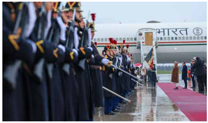
Prime Minister Narendra Modi arrives at Orly Airport in Paris, France, and is greeted by a guard of honour