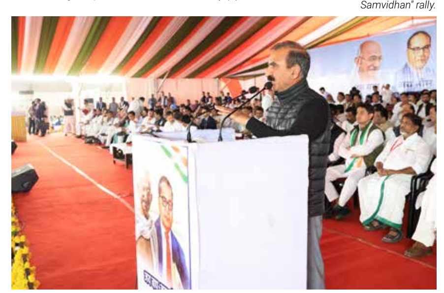
Chief Minister of Himachal Pradesh, Sukhvinder Singh Sukhu, addresses the crowds at the "Jai Bapu, Jai Bhim, Jai Samvidhan" rally in Mhow.