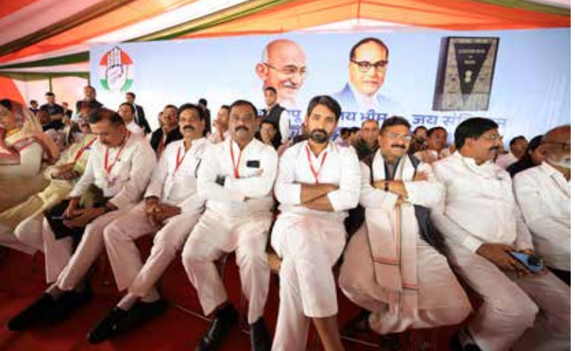
Congress leaders attend Mhow' Jai Bapu, Jai Bhim, Jai Samvidhan' rally across the country.