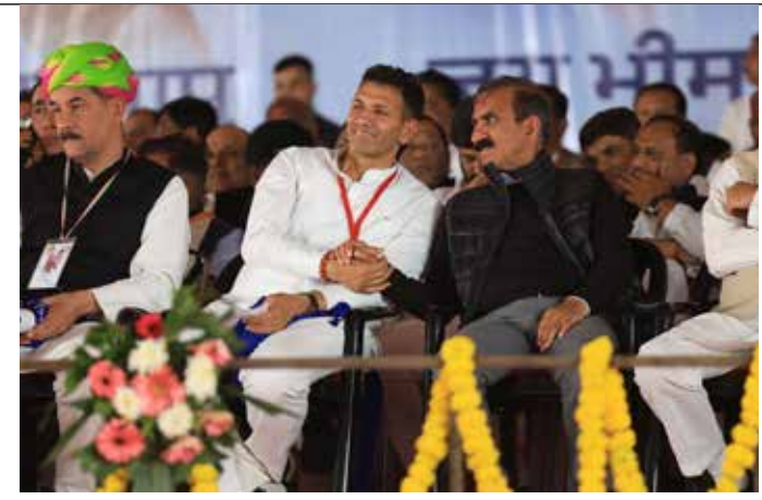
Jitu Patwari, Madhya Pradesh Congress president, and Sukhvinder Singh Sukhu, Chief Minister of Himachal Pradesh