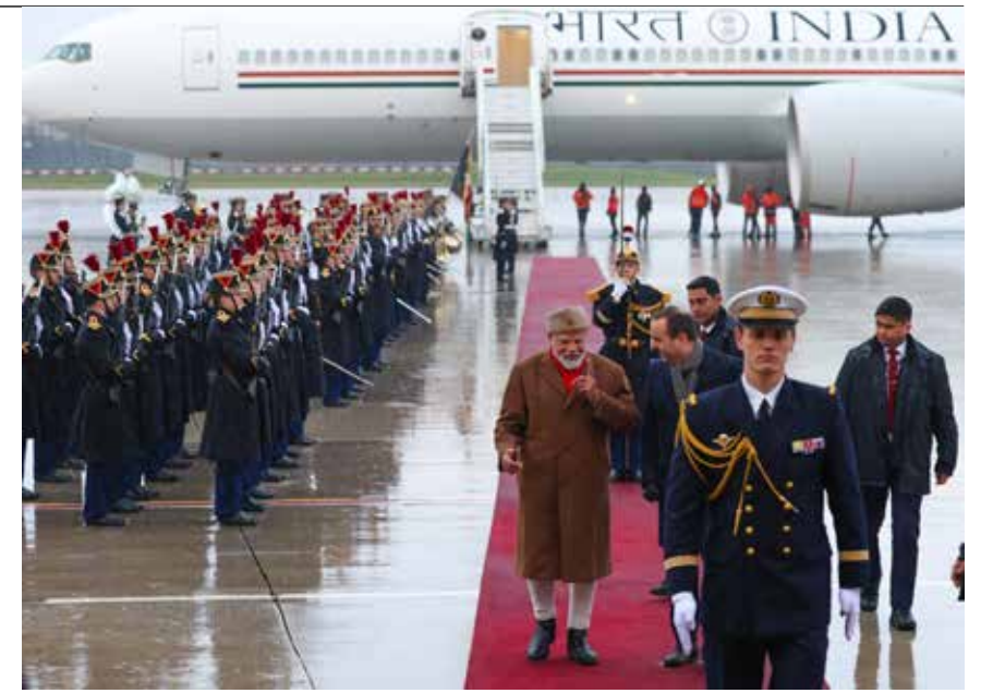
Prime Minister Narendra Modi speaks with Sebastien Lecornu, Minister of the Armed Forces of France, as he arrives at Orly Airport in Paris, France, on February 10, 2025.

The decision to open a Consulate General in Marseille was announced during the Prime Minister's visit to France in July 2023. The Consulate