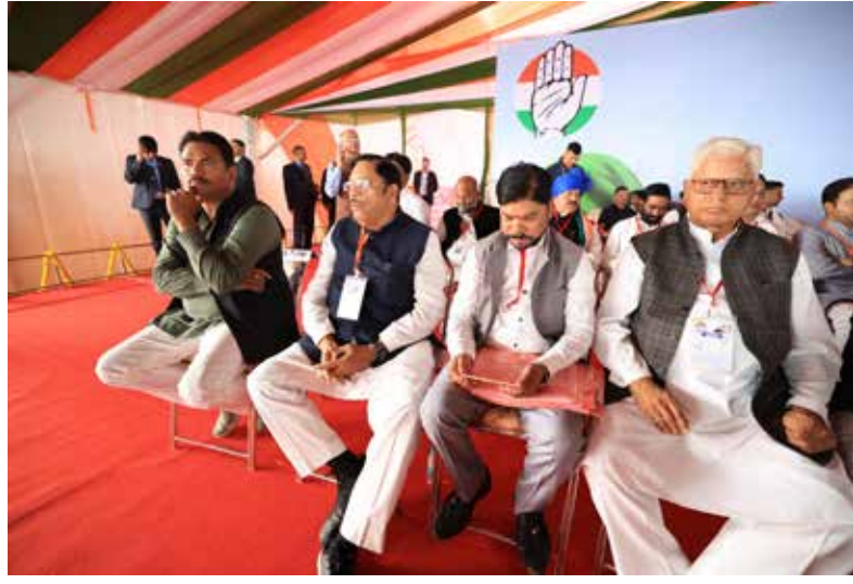
Congress leaders attend Mhow'Jai Bapu, Jai Bhim, Jai Samvidhan' rally across the country.