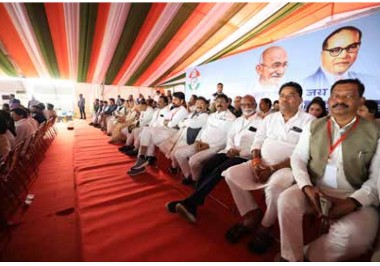
Congress leaders attend Mhow'Jai Bapu, Jai Bhim, Jai Samvidhan' rally across the country.