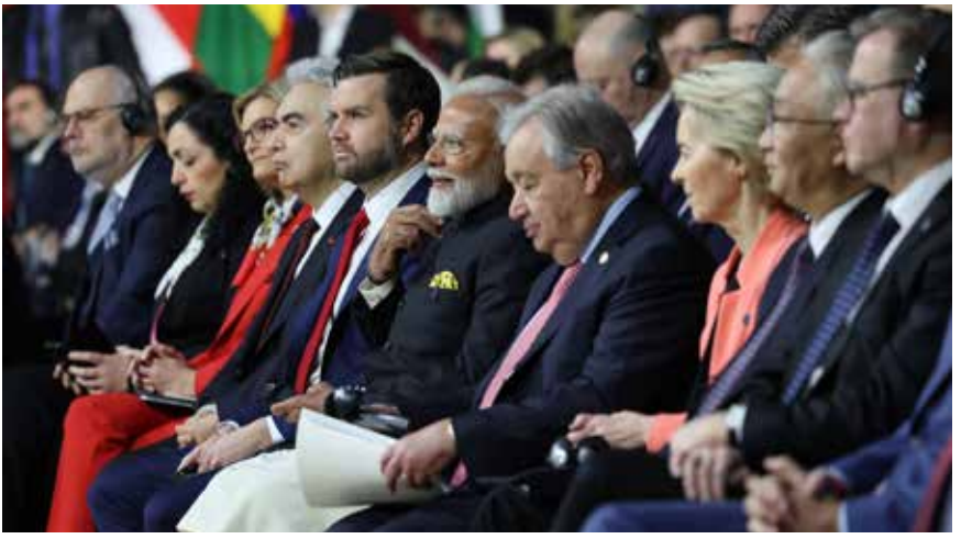
On February 11, 2025, Prime Minister Narendra Modi participated in the Al Action Summit alongside global leaders in Paris, France.