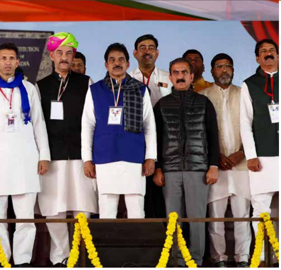
Top Congress leaders attended the "Jai Bapu, Jai Bhim, Jai Samvidhan" rally at Mhow.

Ambedkar, the chief architect of the Constitution.