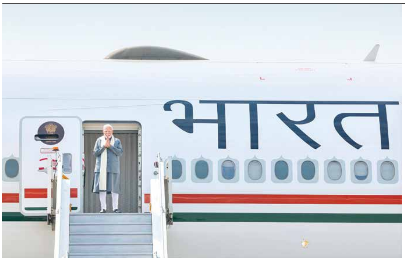
Prime Minister Narendra Modi greets with folded hands before departing for France from New Delhi on February 10, 2025.

with world leaders and global tech CEOs about a collaborative approach to AI technology aimed at stimulating innovation and serving the greater public good in an inclusive, secure, and trustworthy way.