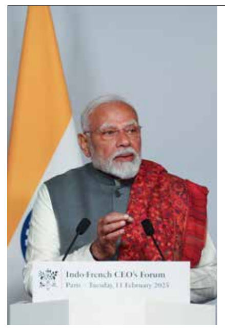
Prime Minister Narendra Modi is speaking at the 14th India - France CEO forum in Paris, France.

of Innovation in 2026. The leaders also called for enhancing trade and investment ties and, in this regard, welcomed the report of the 14th India-France CEOs Forum.