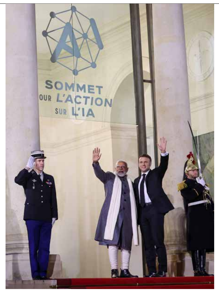
Prime Minister Narendra Modi received a warm welcome from the President of the French Republic, Emmanuel Macron, upon his arrival at Elysée Palace in Paris, France.

According to the website of the Commonwealth War Graves Commission (CWGC), "There are now 1,487, 1914-18 and 267, 1939-45 war casualties commemorated in this site. 205 of the Indian casualties, who were cremated, are commemorated on a