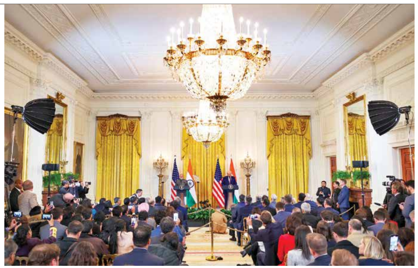
Prime Minister Narendra Modi alongside President Donald Trump during a Joint Press Conference at the White House in Washington, DC, on February 13, 2025.

welcomed a new partnership between Anduril Industries and Mahindra Group on advanced autonomous technologies to co-develop and coproduce state-of-the-art maritime systems and advanced AI-enabled counter Unmanned Aerial System (UAS) to strengthen regional security and between L3 Harris and Bharat Electronics for co-development of active towed array systems.