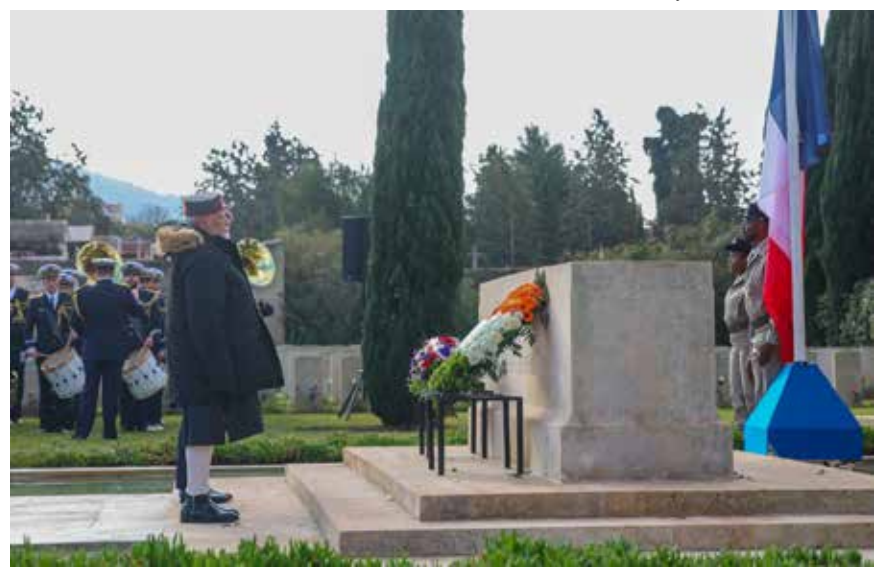
On February 12, 2025, Prime Minister Narendra Modi pays respects at the Mazargues War Cemetery in Marseilles, France.

Talking of the reforms announced in the recent budget, PM noted that the insurance sector was now open for 100% FDI and the civil nuclear energy sector for private participation with a focus on SMR and AMR technologies; the customs rate structure was rationalised; and a simplified income tax code was being brought in to enhance the Ease of Living.