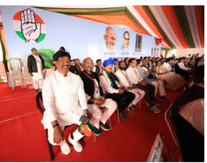
Congress leaders attend Mhow'Jai Bapu, Jai Bhim, Jai Samvidhan' rally across the country.