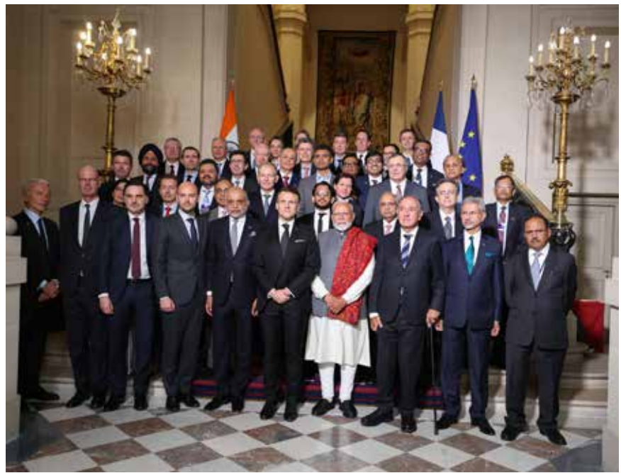
Prime Minister Narendra Modi participated in a group photograph at the 14th India - France CEO Forum held in Paris, France, on February 11, 2025.