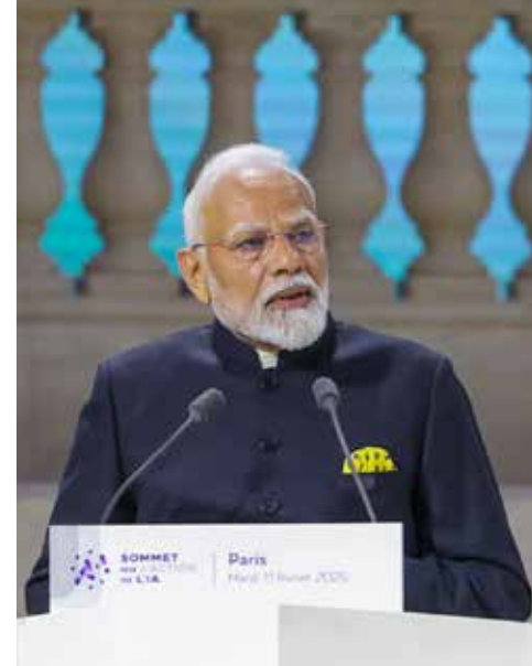
Prime Minister Narendra Modi is addressing the Al Action Summit in Paris, France.

establishment of partnership on Advanced Modular Reactors and Small Modular Reactors Civil Nuclear Energy