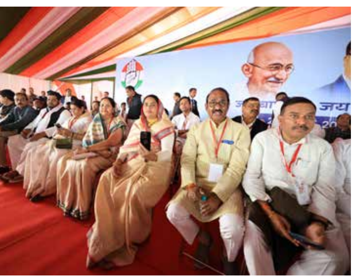
Congress leaders attend Mhow'Jai Bapu, Jai Bhim, Jai Samvidhan' rally across the country.