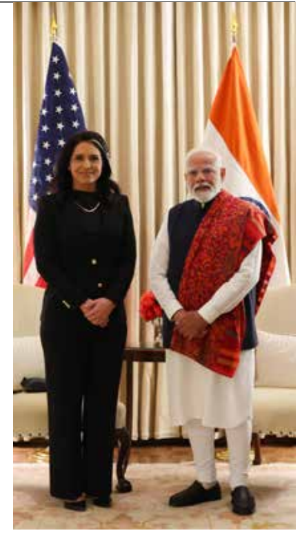
Prime Minister Narendra Modi meets with Tulsi Gabbard, the Director of National Intelligence of the United States, in Washington, DC.