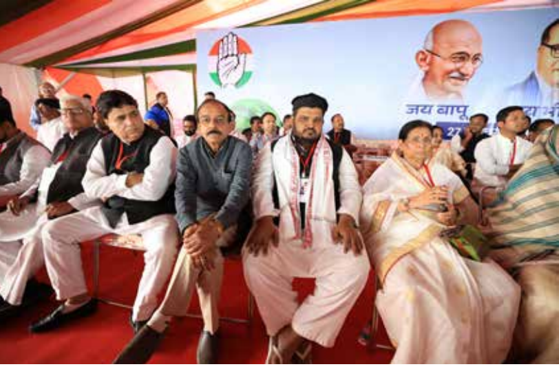
Congress leaders attend Mhow'Jai Bapu, Jai Bhim, Jai Samvidhan' rally across the country.