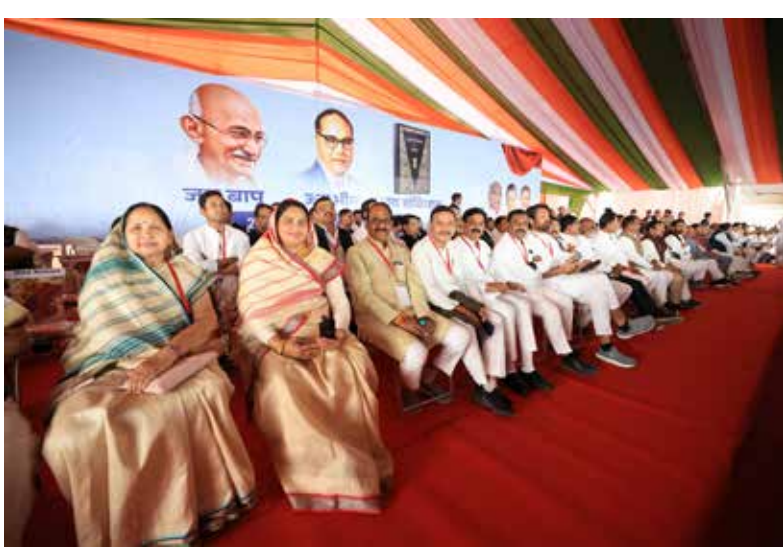
Congress leaders attend Mhow'Jai Bapu, Jai Bhim, Jai Samvidhan' rally across the country.