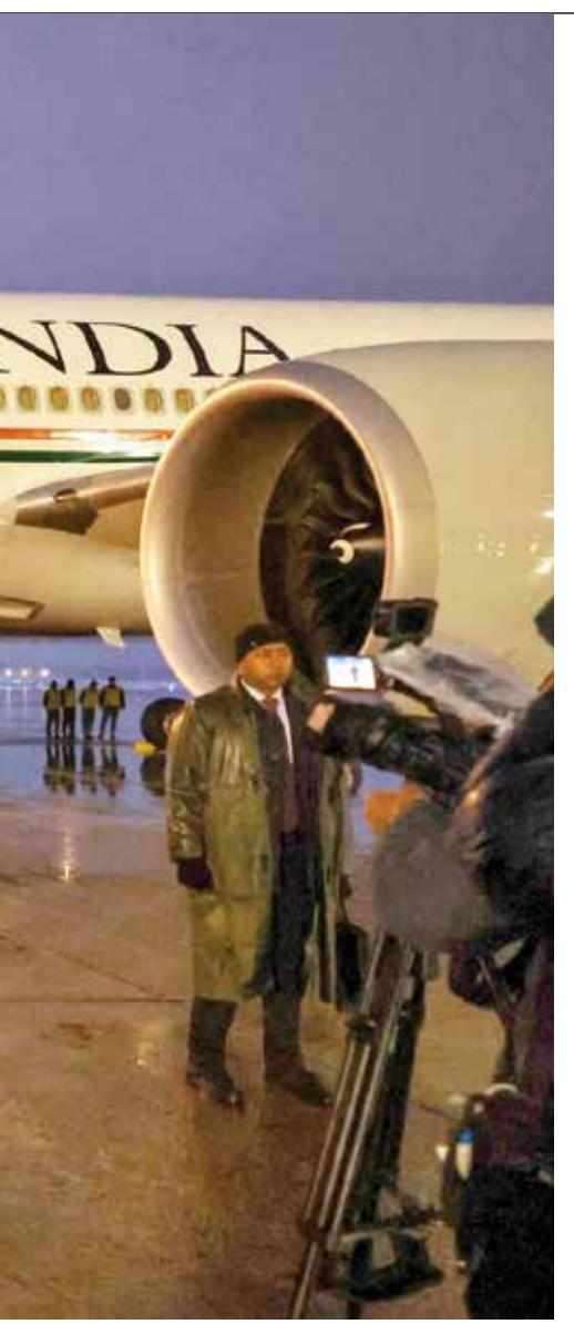
Prime Minister Narendra Modi touches down at Joint Base Andrews in Washington DC, USA.