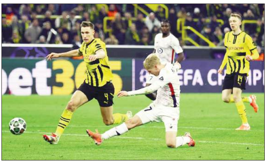
Borussia Dortmund and Lille teams playing in Champions League football in Germany.

At the same time, the Australian team will play its 14th ICC final in the World Test Championship in June. Then it has to face South Africa. At the same time, the England team is at number three in terms of playing finals. It has played the final 9 times. West Indies has played the final 8 times while Sri Lanka has played 7 times and Pakistan has played only 6 times. Australia has played 8 World Cup finals, 2 T20 World Cup finals and 2 Champions Trophy finals. Apart from this, the team has played the World Test Championship final once and this time also the team is in the final. On the other hand, India has played four finals in ODI World Cup, 3 finals in T20 World Cup, 2 finals of World Test Championship and 4 finals of Champions Trophy so far. India is in the final for the fifth time.