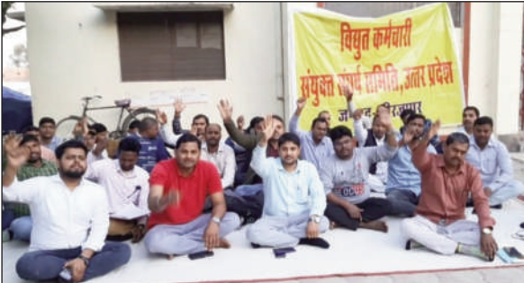
Electrical engineers and employees protesting against the privatization of the electricity department

Staff Reporter Mirzapur, Protests continued on all districts and projects on the 100th consecutive day on the call of the Electricity Employees Joint Conflict Committee, Uttar Pradesh. Central officials of Sangharsh Samiti will be decided to intensify the movement in the meeting being held in Lucknow on March 08. The officials of the Sangharsh Samiti said that it is a matter of great misfortune that the power workers have been protesting continuously for the last 100 days, but the management did not hold talks with the Sangharsh Samiti once during this period. According to the decision of the Sangharsh Samiti, electricity workers are holding protest meetings during food leave or after office time, so that There is no disruption in the work, but it seems that the management has adopted the attitude of