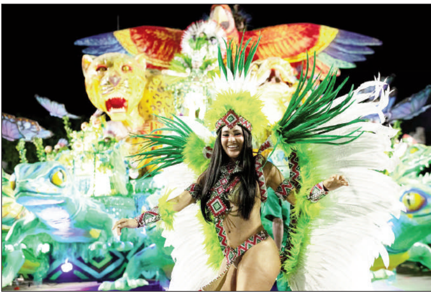
An artist of Sambha School dancing during the carnival in Riare de Janeiro.