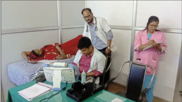
Trained and eligible doctors doing free check and treatment