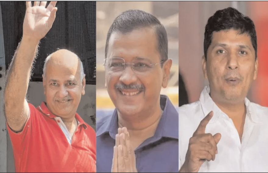
NEW DELHI: Aam Aadmi Party on