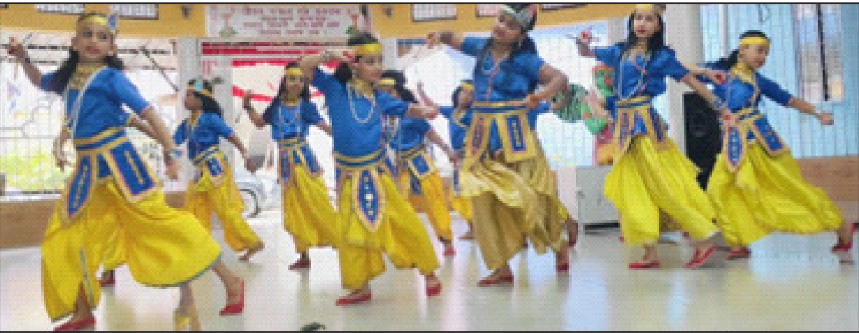
Assamese kids performing at Kristi Kenda