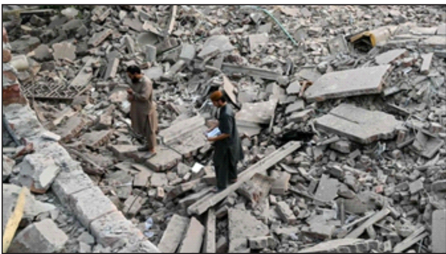
India hit 9 terror sites in Pakistan and PoK under Operation Sindoor on May 7

While resident of border district let out a sigh of relief following the ceasefire