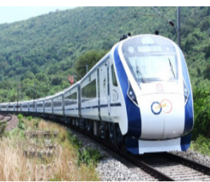
composition of Puri Howrah Vande Bharat Express will have

response to the increasing demand and continued popularity among passengers and tourists, it has been decided to run Puri-Howrah Vande Bharat Express with 20 coaches, effective May 16, 2025 by by augmenting four additional AC Chair Car Coaches. On augmentation, the upgraded rake