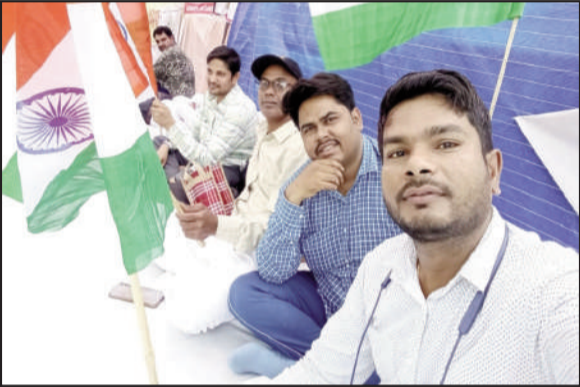
Engineers and employees protesting against electricity privatization and demanding cancellation of appointment of grant thorton

Engineer Revenue Affairs Unit and said that the financial year 2024-25 should provide data of the last five years till 31 March. The Sangharsh Samiti said that