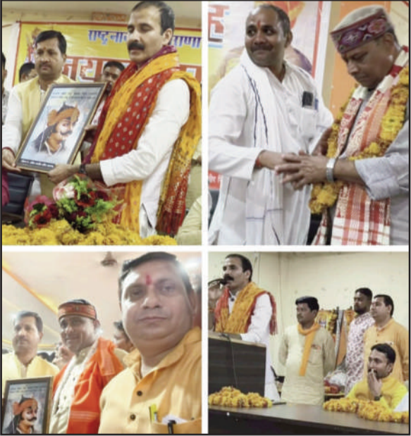
Public representatives and other special people attending the program organized on the birth anniversary of Maharana Pratap

Maharana Pratap Auditorium. The organizer and convenor of the