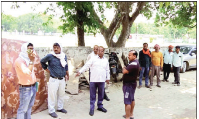
Engineers and employees doing electricity checking in the city area in the presence of Superintending Engineer Electricity