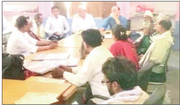
School family organizing a community participation seminar at Babu Uparodh Inter College