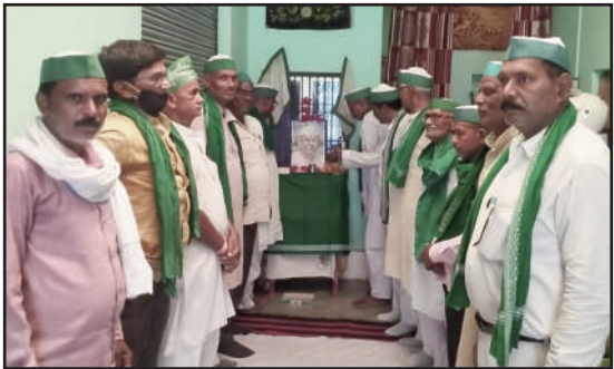
Union officials and farmer leaders celebrating the death anniversary of Chaudhary Mahendra Singh Tikait, the founder of BKU