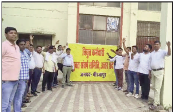
Electrical engineers and employees demonstrating on the privatization proposal of the Electricity Department

consultant should be canceled. For the last one month, the chairman of Power Corporation has been pressing this file and has not