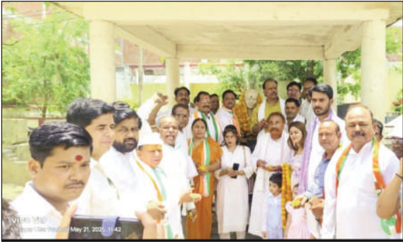
Congress officials and workers celebrating the death anniversary of former Prime Minister late Rajiv Gandhi

Staff Reporter Mirzapur, On the death anniversary of Bharat Ratna former Prime Minister late Rajiv Gandhi at Housing Development Colony Rajiv Gandhi Park While surrendering, he said that poverty alleviation and progress in social harmony science and technology used to make tireless efforts for the uplift of the weaker sections of the society to promote Panchayati Raj institutions and the central role of youth and women in nation building.