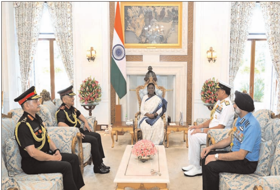
Army chiefs met the President and gave information about Operation Sindoor.

also in actions. Unity in mind, speech, and deed is essential. Hollow words, contradicted by actions, only breed mistrust. I say this because Operation Sindoor is still underway. Raising questions during an ongoing operation casts doubt on one's intent. At a time when the nation must speak in one voice, such actions are not just inappropriate, they are irresponsible," he said. Trump announcing the truce before the India and Pakistan confirmed it has raised several eyebrows over a third party intervention into the matter. Moreover, the US president has repeatedly asserted that the States played a key role in brokering peace between the two nations following their military escalation, even claiming he threatened to halt trade with both nations to prevent further conflict. However, government sources have dismissed these claims, stating that no trade-related discussions took place with US officials since the launch of Operation Sindoor. Despite addressing the nation twice since the ceasefire, Prime Minister Narendra Modi has remained silent on Trump's assertions.