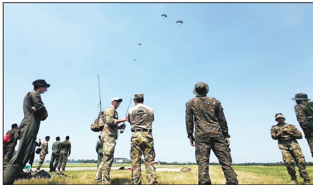
Joint Training: In a first-of-its-kind independent Special Forces exercise between India and United States, Indian Air Force and the United States Air Force have successfully conducted Exercise "Tiger Claw" across North India.