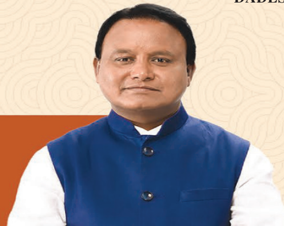
ଶ୍ରୀ ମୋହନ ଚରଣ ମାଝୀ ମୁଖ୍ୟମନ୍ତ୍ରୀ, ଓଡ଼ିଶା