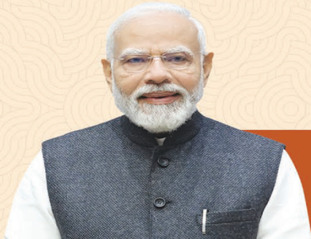
ଶ୍ରୀ ନରେନ୍ଦ୍ର ମୋଦୀ ପ୍ରଧାନମନ୍ତ୍ରୀ