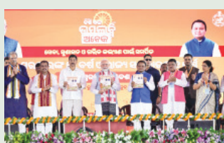
Panchayats, redefining access to quality education in rural areas.

The PM also mentioned about his recent visit to Canada to attend the G7 Summit. "During my visit, US President Donald Trump called me. He said, 'Since you're already in Canada, why not come to Washington too? Let's have a meal and talk.' He extended a warm invitation. I respectfully told the President of the United States, 'Thank you for your kind invitation, but it is essential for me to go to the sacred land of Mahaprabhu'. And so, I humbly declined his offer, because your love and the devotion to Mahaprabhu drew me irresistibly to this holy land," he said.