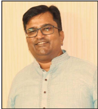
Prabin Kumar Padhy

Introduction: The State of Odisha always boasts of natural resources with abundant mining and vast coastal belt. Energy distribution is something Odisha has niche always including distribution to other states being one of the leading Hydro-power state. But with the increasing demand of energy a need for Energy transition has been felt and Odisha has already turned to Renewable Energy, Green Energy sectors. Under the visionary leadership of Chief Minister Mohan Charan Majhi and leading the Energy Department Deputy Chief Minister Kanak Vardhan Singh Deo, Odisha is witnessing a renewable energy renaissance. The state's Energy Department, in coordination with GRIDCO, OREDA, OHPC, OPTCL and other stakeholders, is driving a dynamic green transition that aligns with the Ministry of New & Renewable Energy (MNRE)'s national goals and Prime Minister Shri Narendra Modi's SDG 2030 vision for India.