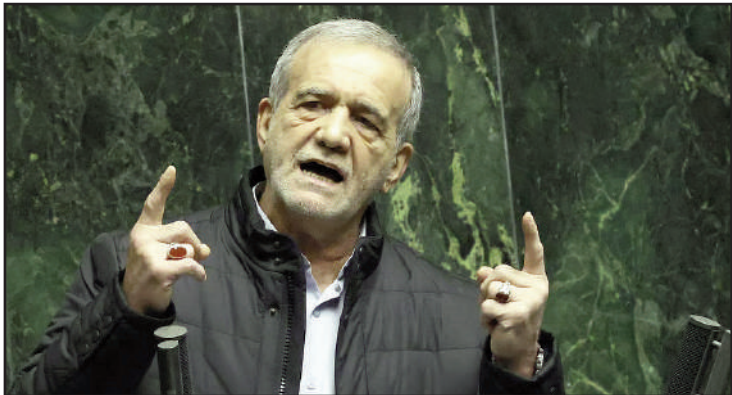
AFP. Iranian Foreign Minister Abbas Araghchi said in a statement he had told IAEA chief Rafael Grossi in a phone call that "Iran will respond to

TEHRAN (Agency): Iran on Sunday warned it would retaliate if European powers "exploit" a UN report showing it has stepped up production of highly enriched uranium. The report by the International Atomic Energy Agency said Iran had sharply increased its stockpile of uranium enriched to up to 60 per cent, close to the roughly 90 per cent level needed for atomic weapons. Iran's total amount of enriched uranium now exceeds 45 times the limit authorised by a landmark 2015 agreement with world powers, and is estimated at 9,247.6 kilograms, according to the confidential IAEA report seen by