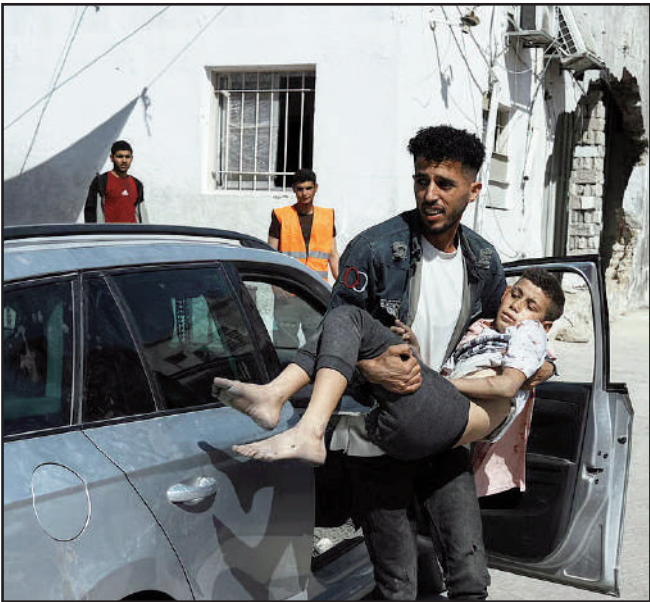
including infants. The centre echoed GMO's and PFLP's remarks that the Israeli army's aid distribution points are a "deliberate trap for civilians" as they are placed deep inside

"We demand urgent international and Arab intervention to stop this ongoing massacre and impose strict accountability mechanisms on the criminal occupation, in addition to immediately breaking the siege," it added. The PFLP had earlier warned the desperate Palestinians that aid points set up by Israel and US were "death traps." On the other hand, the 'Palestinian Center for Missing and Forcibly Disappeared Persons' on Friday raised an alarm regarding Palestinians vanishing from the aid sites set up by the Israeli army after Israel's three-month long blockade of humanitarian assistance pushed the entire population of Gaza into a famine like situation, starving at least 57 people to death, mostly children