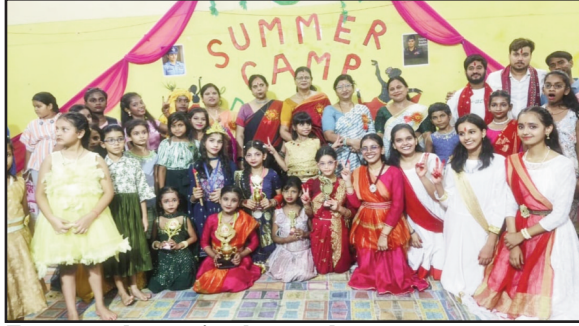
Encouraged to receive the award