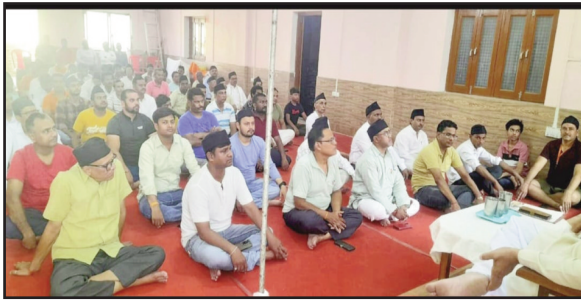
Rashtriya Swayamsevak Sangh's branch caretaker and idea family workers celebrating Hindu Empire Dinotsav

maternal uncle Shaista Khan the Subedar of South India on the insistence of Badi Begum of Bijapur to face Shivaji's challenge. Shaista Khan