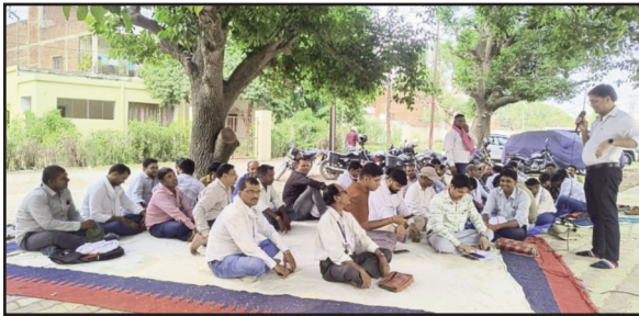
Engineer speaker addressing the ongoing protest meeting against electricity privatization

thisIt was taken that all the power workers across the country will take up nationwide strike on July 09 to protest against the process