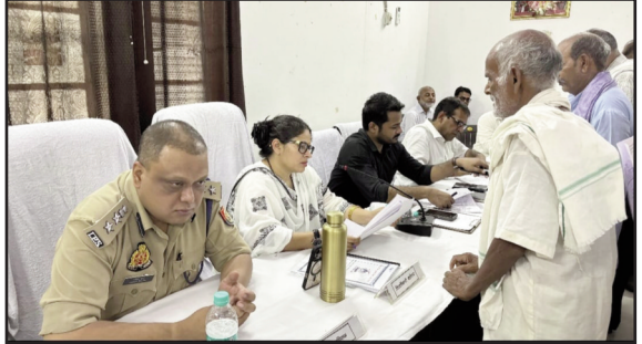
District Magistrate Priyanka Niranjana resolving problems in Sadar tehsil on Tehsil Day

• 21 of the 93 applications received before DM in Tehsil Sadar disposed of on the spot • Show cause notice issued to lekhpal