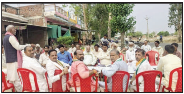
Organization Creation and Save Constitution Conference, senior Congress leaders and workers