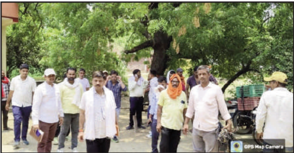
Electrical engineers checking electricity in the mega drive campaign run by the Electricity Department