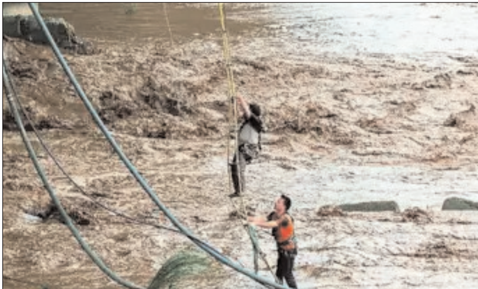
Traffic on Jammu-Srinagar national highway was restored after a three-hour closure on Tuesday due to rain-triggered mudslides near Ramban. Meanwhile, nine people trapped in the swollen Tawi river were rescued in a joint operation by police, SDRF and local volunteers.

will launch atop a modified version of the LVM3 rocket, which has already demonstrated its reliability in placing payloads in space. Training of astronauts will also become largely home-grown. While Sharma trained in the Soviet Union, and Shukla trained partly in the US for this mission, India now has a dedicated astronaut training facility in Bengaluru, which will be enhanced in the coming years. This will allow future Indian astronauts to be selected, trained, and flown from home soil. The broader goal extends beyond low-Earth orbit. Over the next two decades, India aims to build long-term human presence capabilities, develop space station modules, and implement lunar crewed missions. But those are plans for the future. What's certain for now is that with institutional structures, flight-tested hardware, and committed investment, India's return to space with its own people aboard will no longer be an event separated by generations. Shukla's spaceflight marks the end of a long silence. The next Indian in space, it appears, won't have to wait four decades.