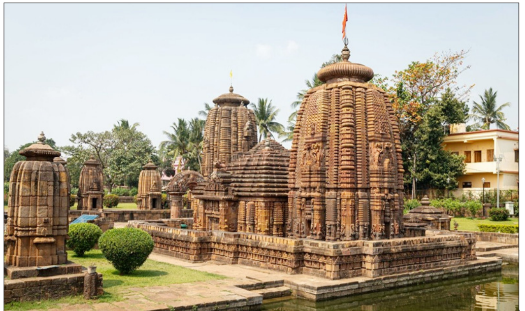
The 10th century Mukteshwar Mahadev Temple in Bhubaneswar

The state government has urged all eligible beneficiaries to complete the e-KYC process as soon as possible to ensure continued access to subsidised food grains. A higher amount of paddy was procured during this year because the state government has started providing Rs 3,100 per quintal of paddy to the registered farmers. Earlier, many farmers were selling their paddy to traders of other states, he said.