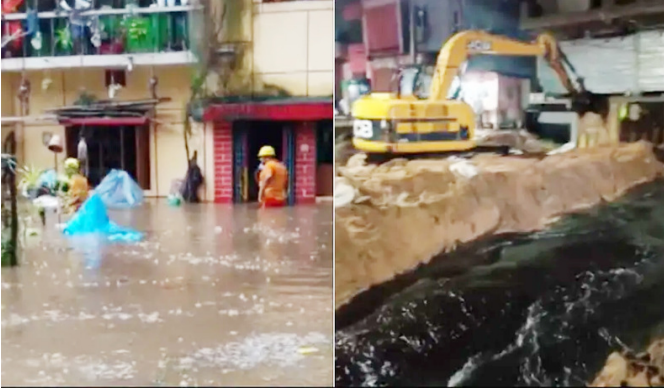
BMC Commissioner directly at the site, showing him the ground-level situation. Despite the deployment of pump sets to clear the water, the

The situation remained breathless in Badagada since Thursday, with knee-deep water inside many homes, forcing several residents to leave their houses and take shelter in nearby hotels. People questioned the