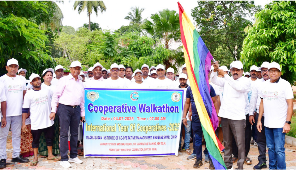
Minister of Cooperation Pradeep Bal Samanta flagging off ‘Cooperative Walkathon’ to mark the International Year of Cooperatives in Bhubaneswar on Friday