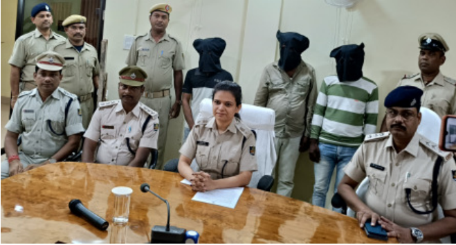
ACE, One CD Deluxe Bike, One OLA Scooter, One Passenger Auto, Two number of Wooden Planks, One Mobile Phone of deceased & registered a case vide IEPS case no-156/2025,u/s-103(1)BNS. All the accused were forwarded to the judicial court of Khordha, informed the SP.