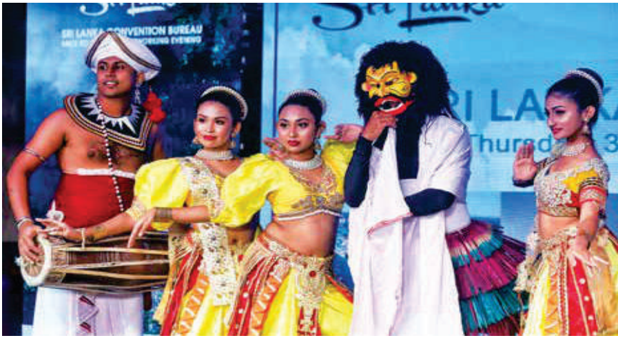
Artists wearing Sri Lankan traditional dress perform at an event organised by the Sri Lanka Convention Bureau (SLCB) in Bengaluru on Thursday.