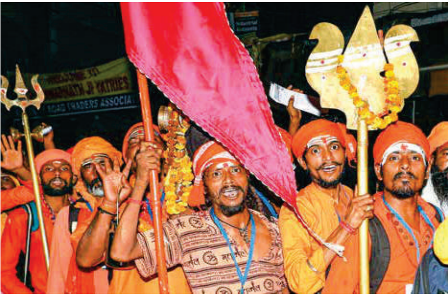
Pilgrims chant religious slogans as they leave for the annual Amarnath Yatra from Ram Mandir base camp in Jammu on Thursday.