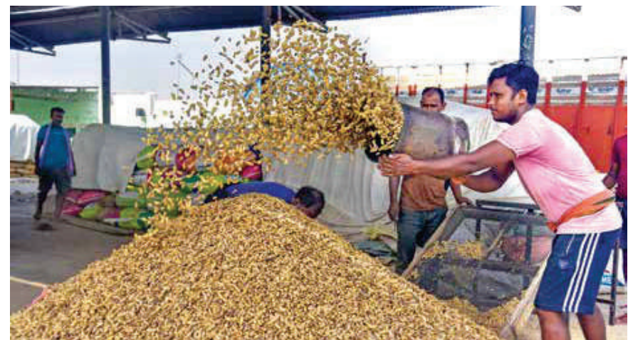
Workers at a grain market in Bikaner on Thursday.

dices also mirrored this movement and closed on a flat note. In Asian markets, South Korea's Kospi, Japan's Nikkei 225 index and Shanghai's SSE Composite index settled higher while Hong Kong's Hang Seng ended lower. European markets were trading on a mixed note. The US markets ended mostly higher on Wednesday. The Indian services sector growth touched a ten-month high in June aided by robust expansion in international sales and job creation, amid positive demand trends and ongoing improvement in sales, a monthly survey said on Thursday. The seasonally adjusted HSBC India Services PMI Business Activity Index rose from 58.8 in May to 60.4 in June, driven by sharp upturn in new business orders. In the Purchasing Managers' Index (PMI) parlance, a print above 50 means expansion, while a score below 50 denotes contraction. Global oil benchmark Brent crude declined 1.03 per cent to USD 68.40 a barrel.