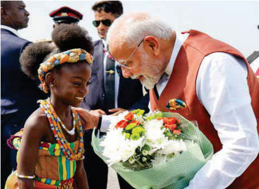
Prime Minister Narendra Modi being welcomed upon his arrival at Kotoka International Airport in Accra.

The Prime Minister underlined that the world order created after World